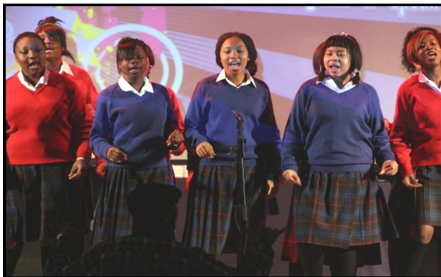
Figure 5. From Elwood's website. Reproduced with permission

Elwood attracts a student composition of mainly Black African and Black Caribbean girls (or, at least, that is the strong impression generated through their school brochures and websites, where the majority of images display a disproportionate number of Afro-Caribbean girls). This carries implicit meanings around community and localism where the emphasis appears to be on serving locally defined 'needs' and expectations. Elwood for example boasts a commitment to the tradition of church-based 'praise music', namely gospel choir singing, which has strong links with members of British Afro-Caribbean communities (Broughton, 1996). The visual iconography in Figure 5, then, reflects engaged attempts to invoke or identify a local structure of feeling based on perceived shared understanding, values and aspirations.