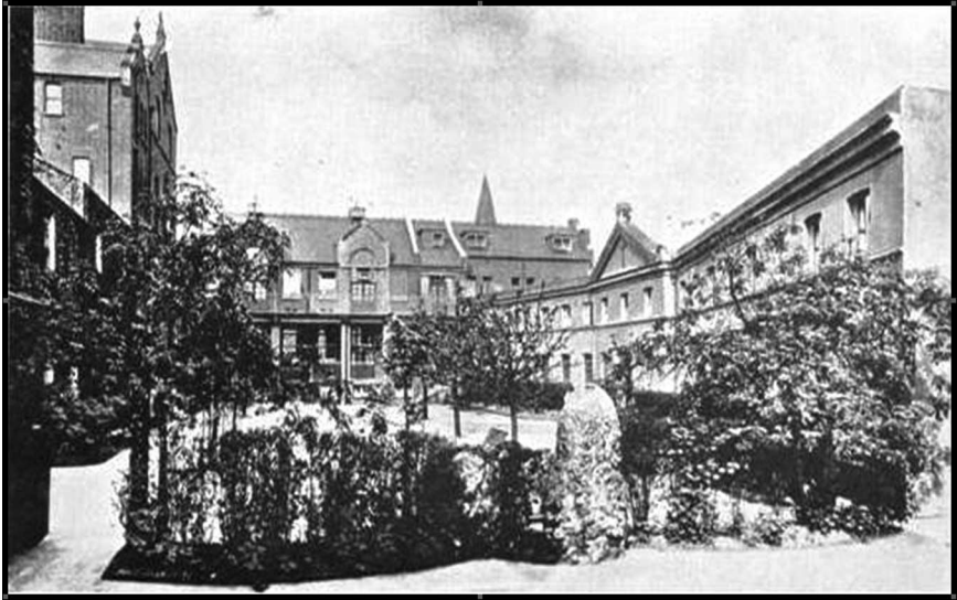
Figure 4.

communicate a sense of structure, history and grandeur, in particular, a desire for a past order of social relationships.