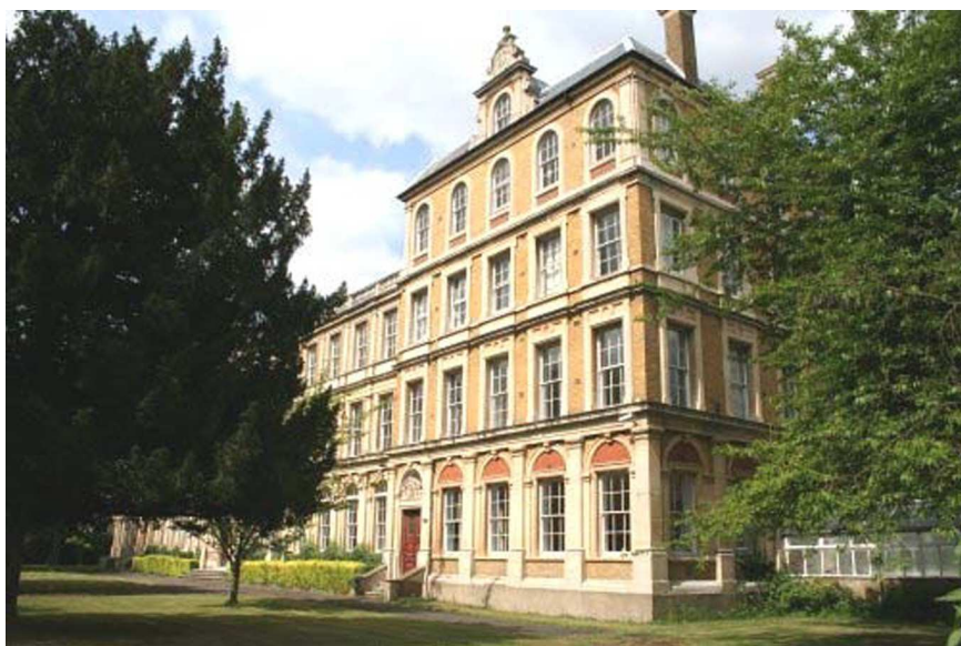
Figure 2. From Greendale's website. Reproduced with permission

In what follows I analyse and compare how meanings of tradition and community are effectively communicated through the visual representation of Elwood and Greendale, pointing to how socially circulating discourses become objectively ironized and transformed into artefacts for the private act of consumption (namely, the process of choosing a school).