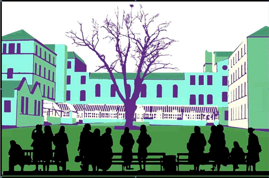
Figure 3.

brick-fronted building, with its handsome square-fronted symmetrically planned windows, picturesque clump of trees and hedgerow, generates a strong image of upper-class grandeur, solidity and affluence. The combination of a calm luminous sky and wide open green space and unspoiled surroundings complements the staging of an Arcadian setting through communicating a dominant impression of tranquillity, regularity and order. The entrance door and ground-floor windows are flanked by pilasters, adding to the elegance of the building and, in particular, to its enduring history as an 'old' building. Viewed in this way, the rigidly stratified floors, typical of most Georgian architecture, give an impression of social prestige and unspoiled, enduring culture. Indeed, the decorative horizontal band (or strong course) on the exterior wall, used to mark out and separate the floors, conveys a strong image of hierarchy and order and the enduring presence of the school through history and time. This structure of feeling appears to be echoed through Figure 3, also taken from Greendale's website.