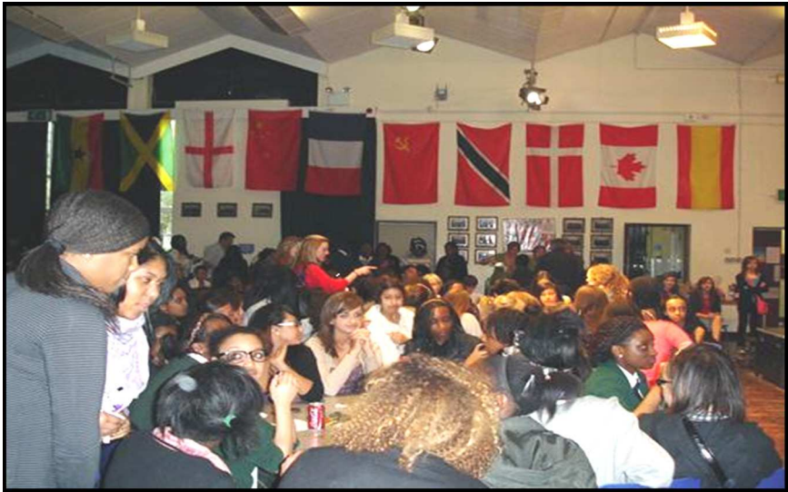
Figure 6.

female students of diverse ethnicities mingling together in the foreground, situated against a backdrop displaying national flags from around the globe.